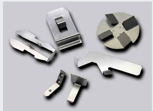
Example parts made with the MIM process. This process allows for high volume, complex parts produced in a single step.